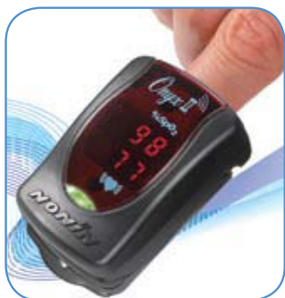
Onyx® II, Model 9560 - The World's First Bluetooth® Wireless Fingertip Pulse Oximeter

The Onyx II, Model 9560 with Bluetooth wireless technology is designed with our proven PureSAT® oximetry technology and delivers the trusted, precision accuracy of the entire Onyx line. And now with the advantage of wireless monitoring capabilities — the built to last and easy-to-use Onyx II 9560 provides unparalleled versatility for patient and clinician. Plus, with the addition of innovative new features such as Extended Range and Power Saver — it's ideal for home patient use.